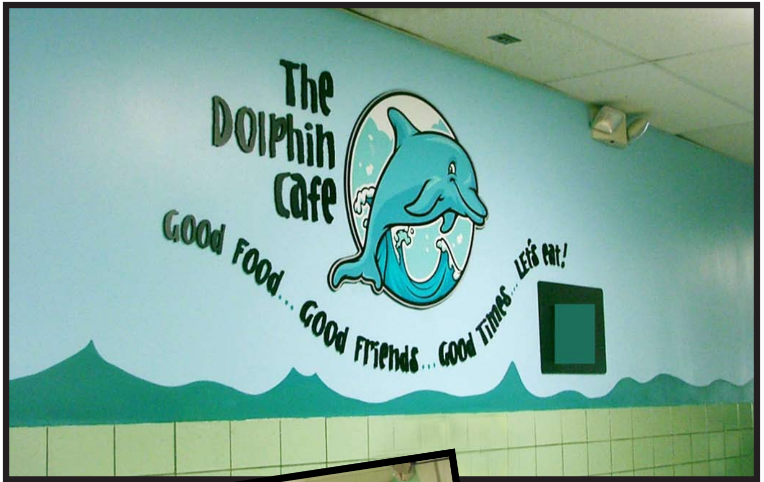
Milford, CT The Dolphin Cafe